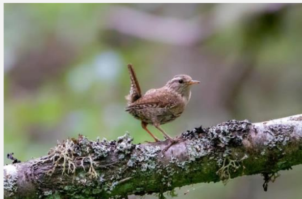
One of Sam's photographs

Please remember your name and Club with your entry