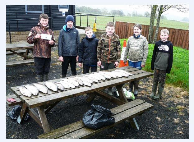
A 'bubble' of young anglers display their hauls.

our other main sponsors, Frasers Angling and Outdoors (Gateshead), The Barbour Foundation and other private donations for their valuable contributions. Additionally, we are indebted to the Wansbeck Angling Association for their services monitoring the event and conducting the "weigh-in".