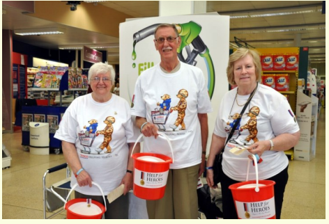
Help for Heroes

Lion Club have been very limited in our activities, but we are holding our one and only official event on the 27th June when we shall be bringing both clubs together to celebrate the past 44 years of Lionesses and to officially induct us into the Castleford & Pontefract District Lions Club so we can continue to serve our community and Lions Clubs International.