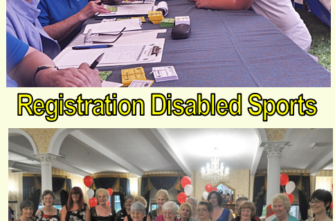
40 Certification 2017