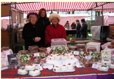
Victorian Christmas Market