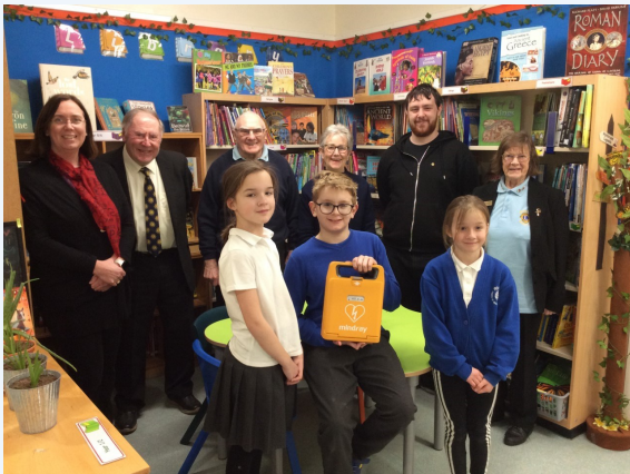
Long Riston School

A photo shoot was arranged at .Long Riston, Sigglesothorne, Skirlaugh . Hornsea Burton and Hornsea Community Schools.