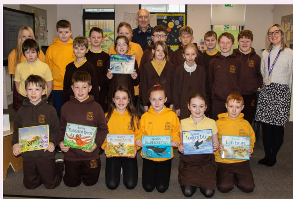
Tarbolton Primary School

These have all been received with great enthusiasm and followed an initial presentation to Alloway Primary School which prompted requests from other schools.