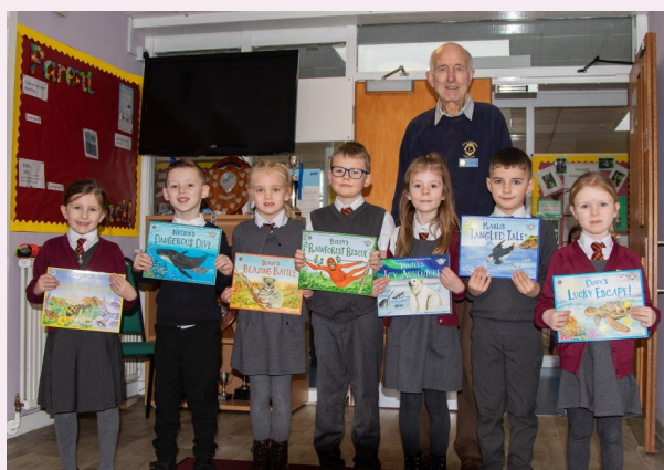
Garden Rose School