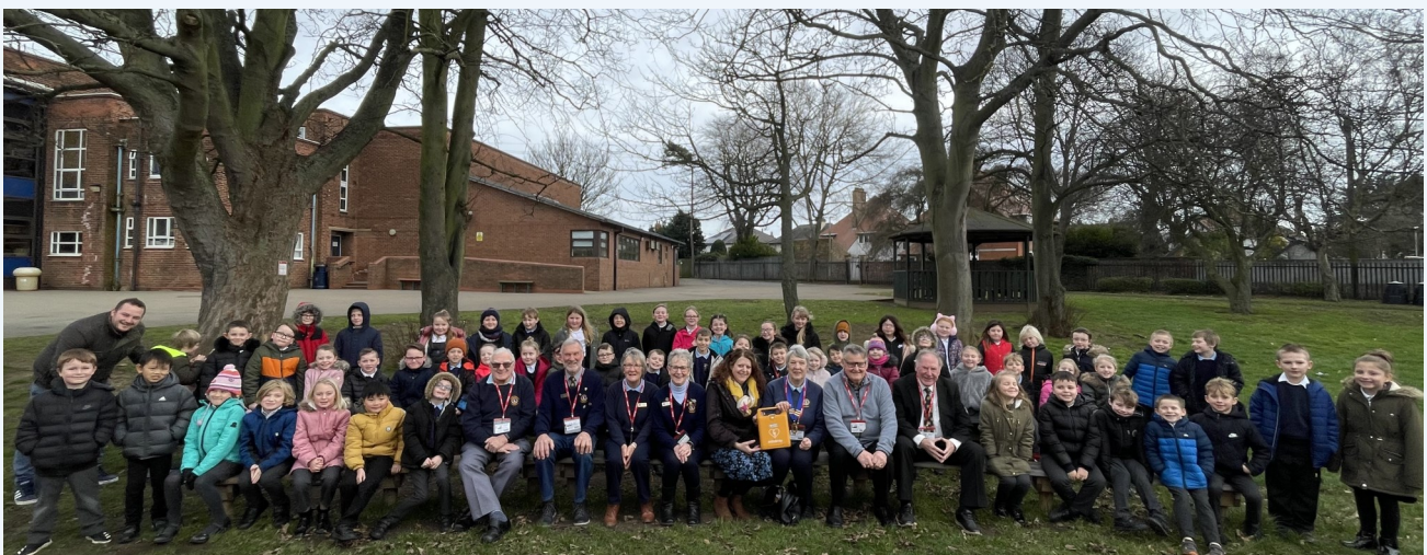
Burton and Hornsea Community School