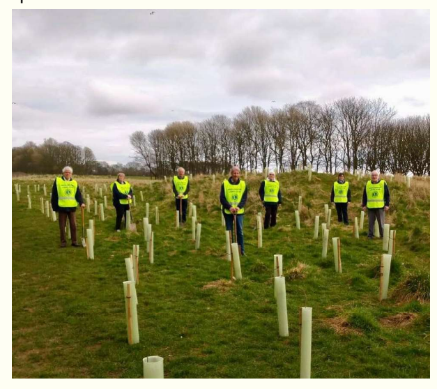
Club members planting the trees

Another example of Lions serving their community and the planet