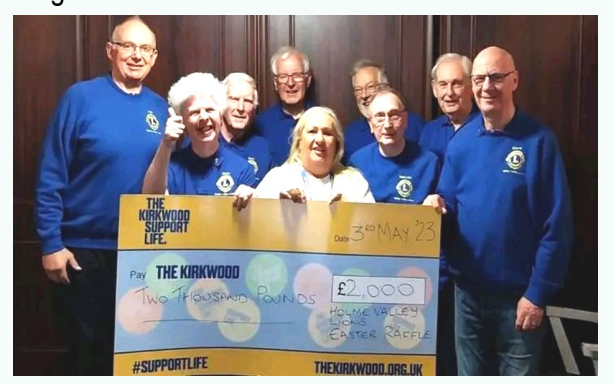
Presentation to Kirkwood Hospice Continued overleaf

During February to Easter we sold raffle tickets outside local supermarkets/farm shops and garden centres in aid of Kirkwood Hospice and sold all 2000 tickets raising for them £2000.